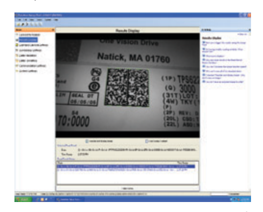
The DataMan setup tool gets applications up and running fast.

Quick setup is facilitated by the setup tool common to all DataMan products. Point-and-click configuration, a display of the image that DataMan sees, a display of results (decoded images and data) — and many more features — all add up to the most intuitive and complete user interface available. USB and RS-232 interfaces are provided.